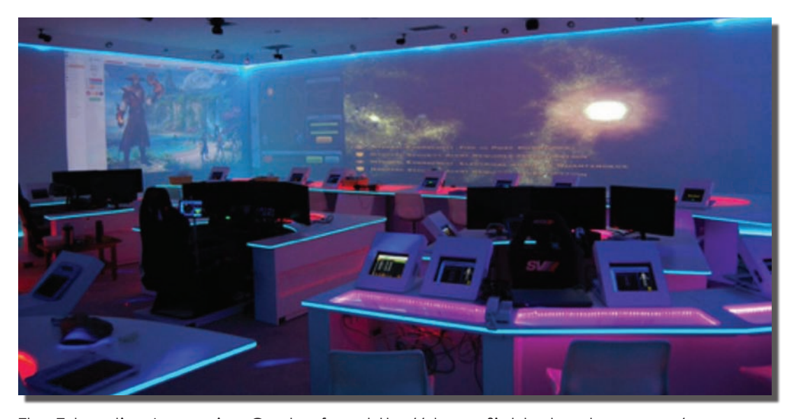
The Education Immersion Center

While the Education Immersion Center is impressive, a teacher wanting to incorporate