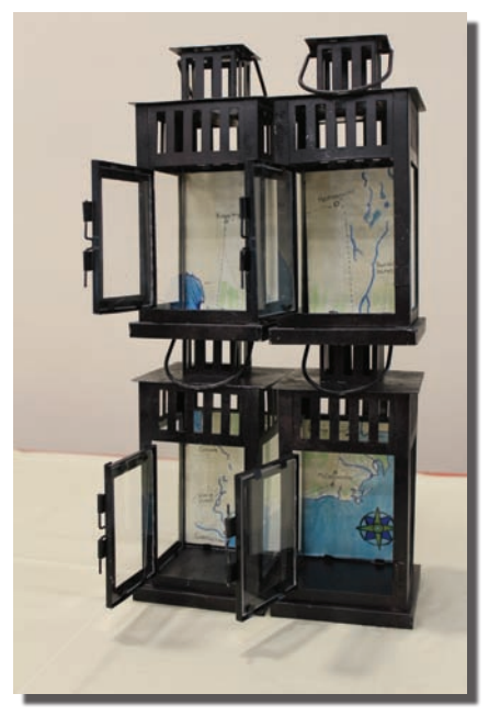
Puzzle for historical escape game from Escape Room Camp

these concepts can do so in his or her classroom by using an ongoing narrative and a variety of challenges. As students develop characters in a world where their actions have impact on an ongoing narrative, they are empowered to be more engaged than if the games are over in an hour. Encouraging the students to keep journals and help write the narrative from their characters' perspectives builds empathy and helps them understand that history has many perspectives.